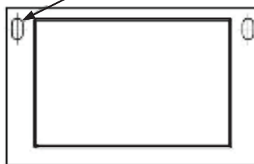
PLAN VIEW OF POLYPRO WORK SURFACE